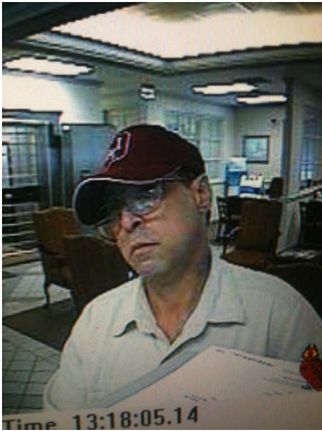
Photo taken during Tomball robbery.